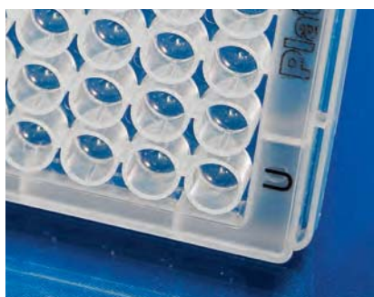
Well-bottom shape indicator code on every plate for easy identification