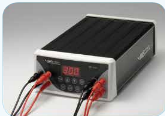
Four pairs of outlet terminals